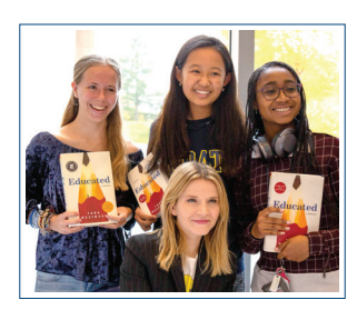
Author Tara Westover visits campus.