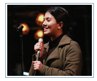
Young artists express their creativity on stage in the Paul Mellon Arts Center.