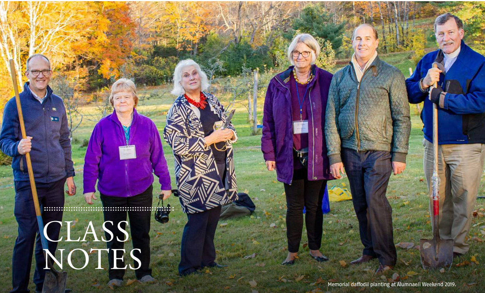
Memorial daffodil planting at Alumnae/i Weekend 2019.